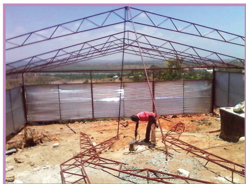
New home of Mombasa Grace School of Ministries under construction