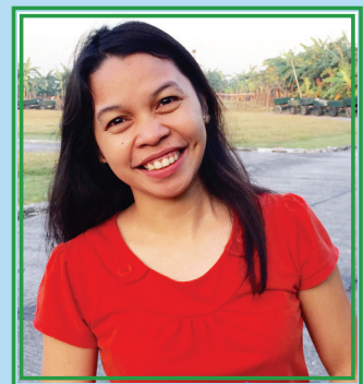
Juna Umacob Philippines to SE Asia